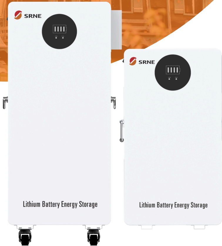
Lithium Battery Energy Storage